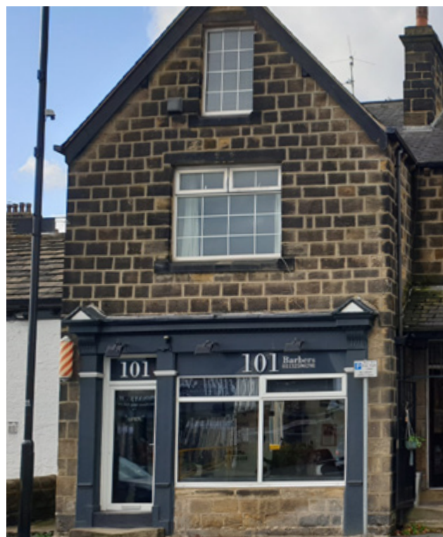
A neat traditional design with restrained colour scheme