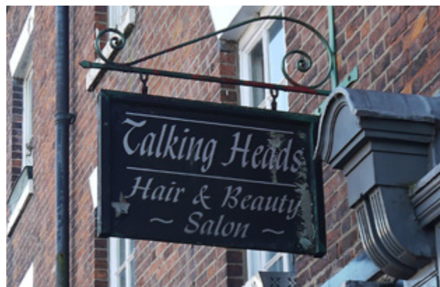
Attractive traditional hanging sign and console type bracket top to pilaster