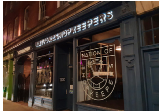
Shadow signage distinctive at night

Advice from your Local Authority should always be sought.