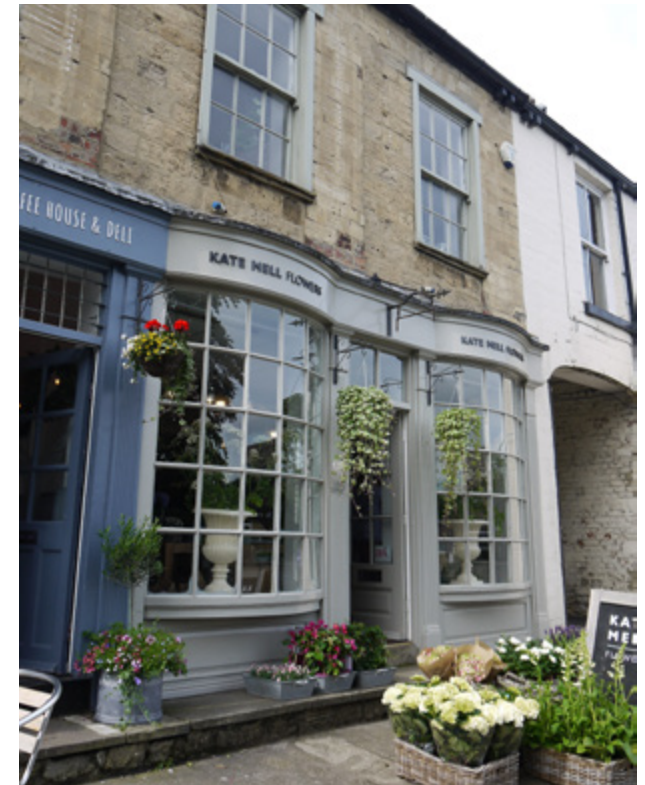
Georgian style frontage

If necessary internal grilles are far better than external roller shutters which create dead frontages, attract graffiti, and prevent viewing of the interior.